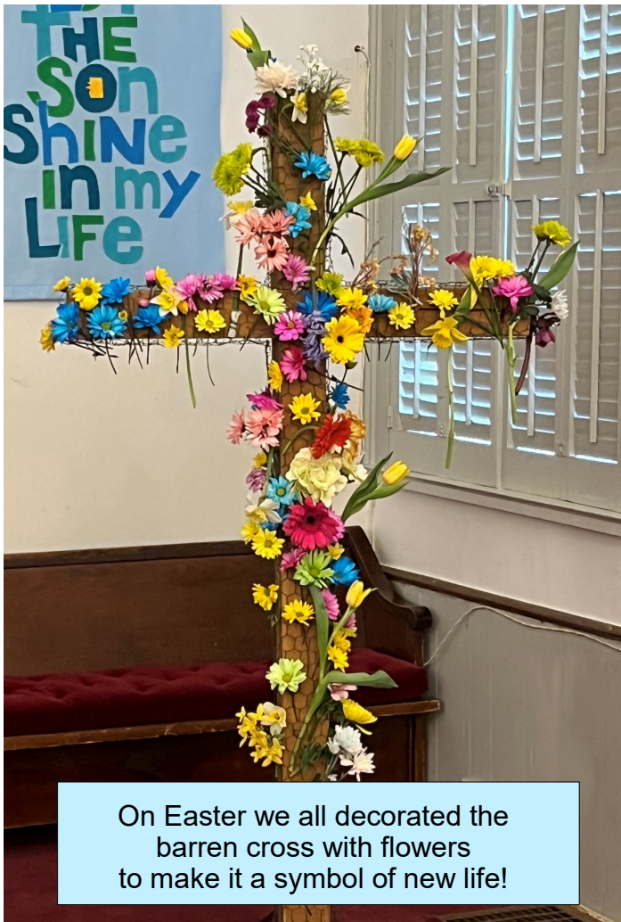
On Easter we all decorated the barren cross with flowers to make it a symbol of new life!

To become an Earth Care Congregation, our congregation affirmed an Earth Care Pledge to integrate environmental practices and thinking into our worship, education, facilities, and outreach.